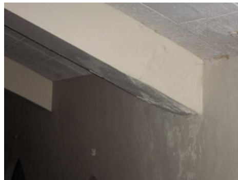
Ceiling and south wall in the Sanctuary