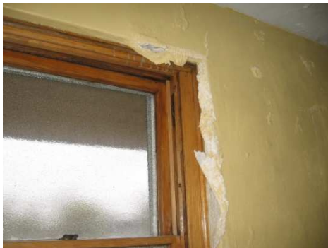
Room behind the Balcony

The Trustees continue to discover new ways water is able to get into the building. McGuff was contacted recently about sealing up some leaks in the roof of the main church building. These leaks have already been doing damage to the interior walls and ceiling and will only get worse if not repaired immediately. For your convenience you may see this damage in the photos below: